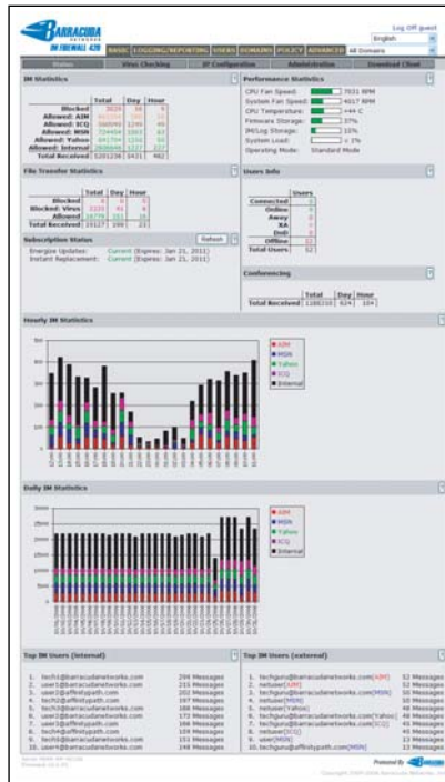
System Administrators can use the intuitive Web interface for detailed monitoring and maintenance.

Whether your internal IM plans require management public IM traffic, or require installing an internal IM server and client, the Barracuda IM Firewall has your IM needs covered. The Barracuda IM Firewall provides tools to manage public IM traffic, as well as an integrated IM server and client to provide a secure internal IM network for your organization.