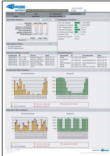
System Administrators can use the intuitive Web interface for detailed monitoring and maintenance.

With no software to install or network modifications required, the Barracuda Web Filter is easy to set up. System updates are delivered automatically by Barracuda Central, an advanced technology center where engineers work continuously to provide the most effective methods to combat the ever changing spam and virus variants. Updates are distributed hourly so that you are always protected against the latest threats.